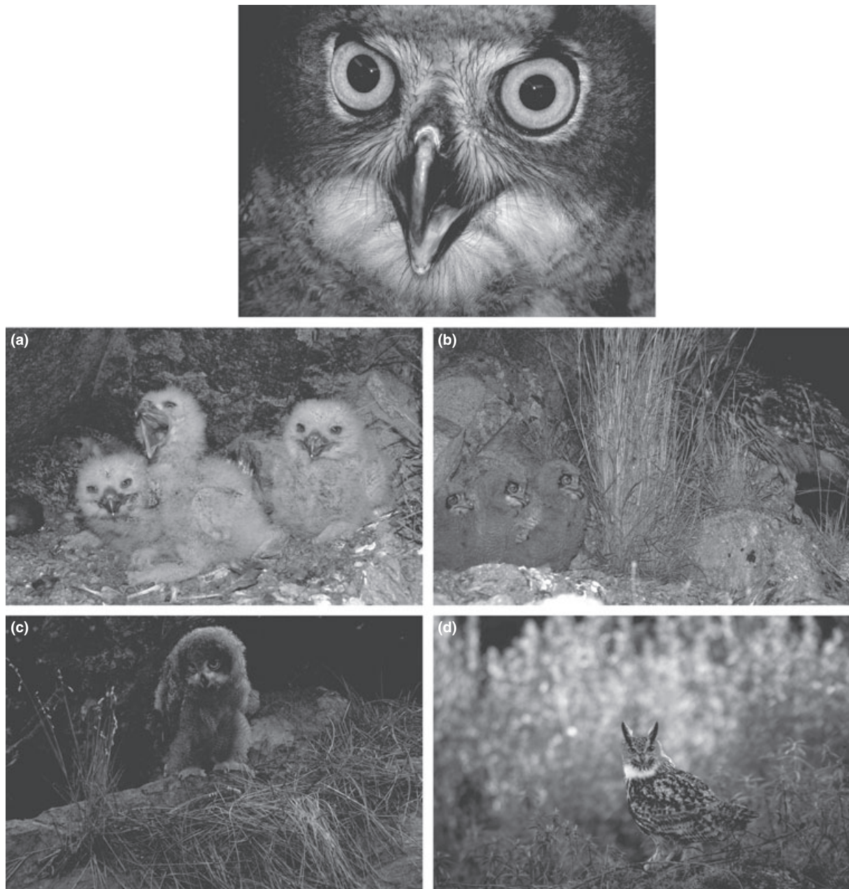
Fig. 1: (a) The white mouth feathers of an owlet during the post-fledging period (approx. 75 d old). (b) Evolution of the white edge of the mouth of eagle owl young, from 10 d old to dispersal. (a) Ten-day-old eagle owls at nest, begging for food. At this stage, the white feathers around the mouth have still not appeared. (b) Three young of 32 (in the middle), 30 (on the right) and 28 (on the left) d old begging when female (on the right of the picture) arrives at the nest with a rabbit. At this stage (approx. a week before fledging) white feathers start to become evident, mainly in the older offspring. (c) Fledgling owl waiting for parental feeding a few hundred meters from the nest. At this stage, a large white edge surrounds the mouth. (d) Adult eagle owl. White feathers are less apparent now and a new, white patch has appeared as a large badge on the throat (see Penteriani et al. 2006).

portable spectrophotometer (Minolta Co., Ltd., Osaka, Japan) with UV (xenon flashlight source) and visible light (standard illuminant D65). Brightness before manipulation showed 23% and 77%